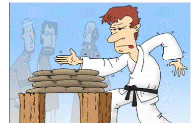
WHEN IT CAME TO BREAKING BREAD, HE WAS THE BEST IN THE BUSINESS

AUSTRALIAN CATHOLIC BISHOPS CONFERENCE: together with the National Centre for Pastoral Research , have released Profiles of almost 1300 Catholic parishes across Australia, with data made available by the Australian Bureau of Statistics, following the 2016 Census. To download the report for our parish here at OLA, please click on following the link: https://ncpr.catholic.org.au/2016-Parish-Social-Profiles/12-Melbourne/Cheltenham.pdf