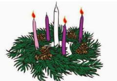
Third Sunday of Advent

A man came, sent by God. His name was John. He came as a witness, as a witness to speak for the light, so that everyone might believe through him. He was not the light, only a witness to speak for the light. This is how John appeared as a witness. When the Jews sent priests and Levites from Jerusalem to ask him, 'Who are you?' he not only declared, but he declared quite openly, 'I am not the Christ.' 'Well then,' they asked 'are you Elijah?' 'I am not' he said. 'Are you the Prophet?' He answered, 'No.' So they said to him, 'Who are you? We must take back an answer to those who sent us. What have you to say about yourself?' So John said, 'I am, as Isaiah prophesied: a voice that cries in the wilderness: Make a straight way for the Lord.' Now these men had been sent by the Pharisees, and they put this further question to him, 'Why are you baptising if you are not the Christ, and not Elijah, and not the prophet?' John replied, 'I baptise with water; but there stands among you – unknown to you – the one who is coming after me; and I am not fit to undo his sandal-strap.' This happened at Bethany, on the far side of the Jordan, where John was baptising.